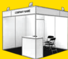
Exhibit Space Cost