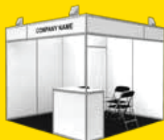
Exhibit Space Cost